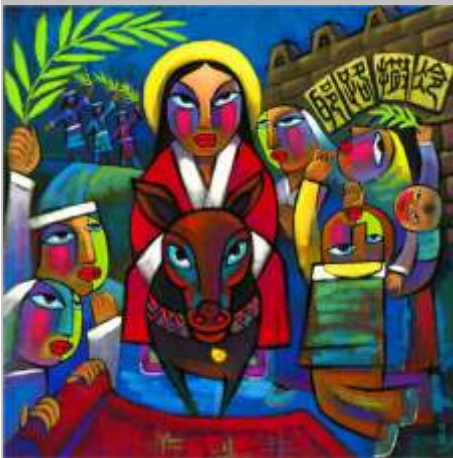
Artist: He Qi