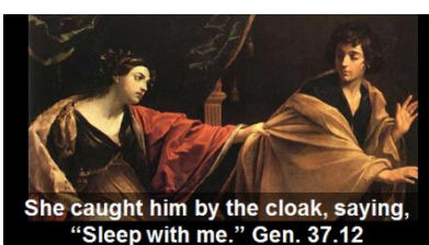
She caught him by the cloak, saying, “Sleep with me.” Gen. 37.12

Joseph’s jealous brothers sell him to Potiphar, the captain of the guard in Egypt. It would equate to chief of police in our day. Joseph prospers as a servant in Potiphar’s household—so much so that he is put in charge of Potiphar’s domestic affairs.