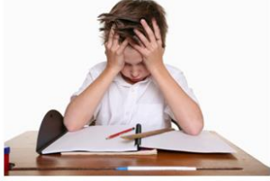
Test: to prove genuine and to refine

“prove” genuine. God tests us to refine us like silver. God doesn’t want us to fail. God intends us to pass the test. God places these brothers in a do-over position so this family can confront their messy past and create a